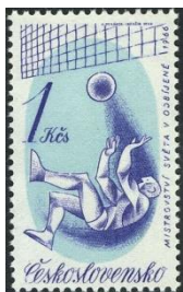
1 Kčs (Koruna) representing a receiver