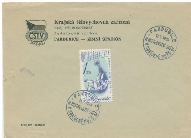
Cover from Pardubice (= Finals 9 - 16)

Krajské Tělovýchovná zařízení Regional sports facilities Kraj východočeský Eastern Bohemia Podniková správa Business administration Pardubice - Zimní stadión Winter stadium