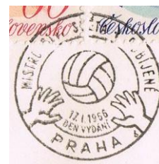
Cancel with b