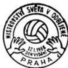
Cancel with a