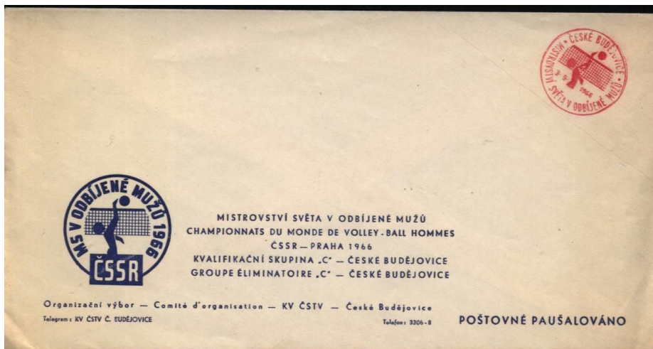
Cover from organization committee České Budějovice (= group C)