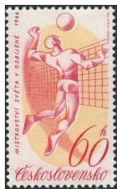
60 h (Haleru) representing a spiker

Praha - Mistrovství světa v odbíjené – den vydání (World Championship in volleyball - release day)