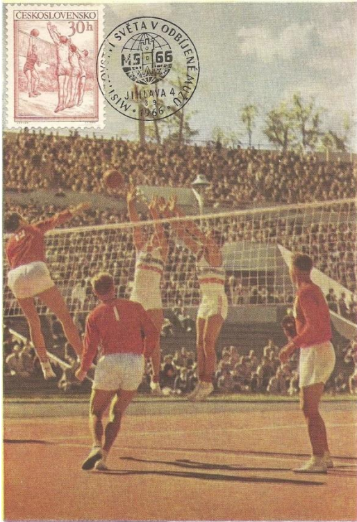
Jihlava 4 - Sep 3, 1966

Postal stationary USSR from Jan 18, 1964 with the Czechoslovakia stamp from Sep 15, 1953.