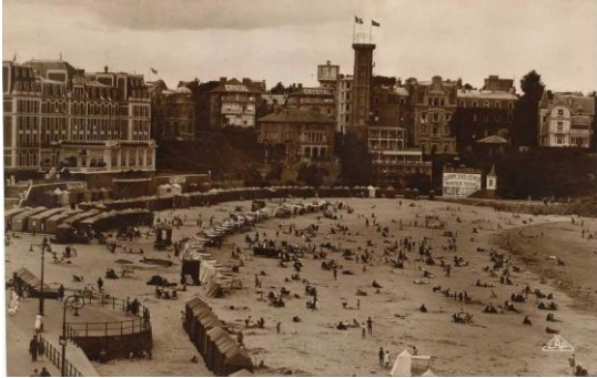
Dinard in 1928

Surprising is that the paintings he made in Dinard can hardly be found in books with the works of Picasso. He made on the beach in Dinard twenty-six paintings. Only five paintings I found so far and only two postcards. One in the Picasso Museum in Paris in 1998 and one in the Picasso Museum in Barcelona in 2002. But perhaps there are more in the meantime.