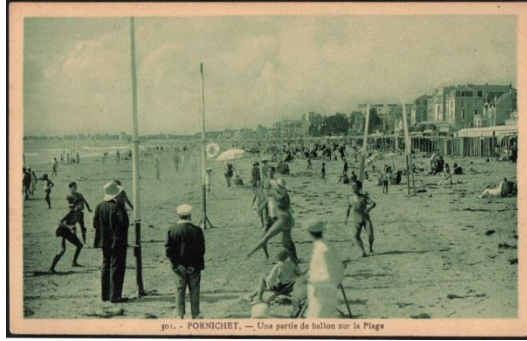
Beachvolleyball during the twenties