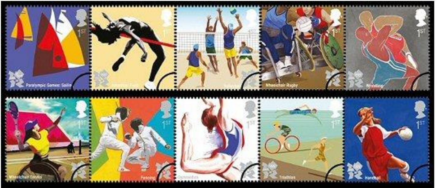
Paralympics Sailing; Athletics high jump; Volleyball; Wheelchair Rugby; Wrestling Wheelchair Tennis; Fencing; Gymnastics; Triathlon; Handball

On July 27, 2011 Royal Mail will issue the third set of ten stamps commemorating the Olympic Games next year. The official FDC is not available yet.